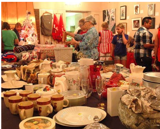
The United Methodist Women's annual Holiday Bazaar was a great success!