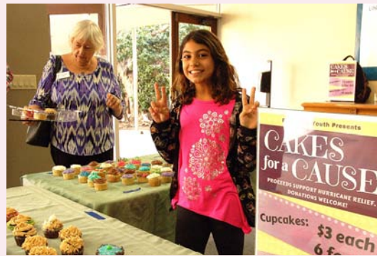
During the Church Charge Conference, the United Methodist Youth sold cupcakes for their annual Cakes for a Cause. This year, they raised over $500 towards hurricane relief. Thank you to all who purchased cupcakes.