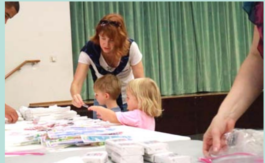
Assembling the UMCOR kits at Messy Church.

grandparents. A Messy Church blessing in worship over the assembled kits, praying for the hands that will receive and use these items. We raised $1,240 and were able to assemble over 125 Hygiene Kits. Yet it didn't stop there. Beyond the kits, we give thanks for the $3,885 that was donated directly by our community to UMCOR for disaster relief.