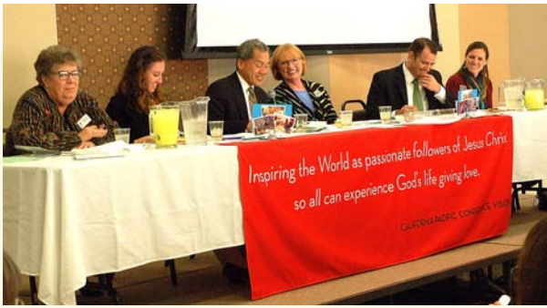
2017 Church Charge Conference