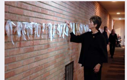
All Saints Day, and the White Ribbon Memorial