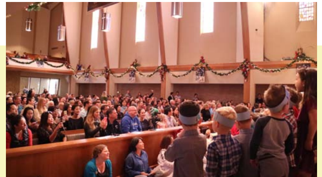
The Preschool Christmas Concert was held December 15 in the Sanctuary.