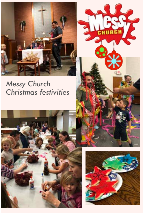
Messy Church Christmas festivities