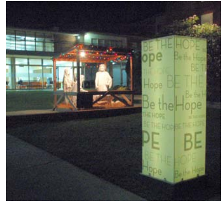
The First UMC creche alongside the Be the Hope sign at night.