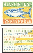
Write for Change: Postcard Art Sketch