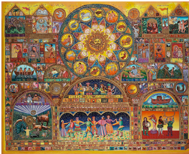
Ecclesiastes

ONLINE Worship • Back to School Blessings • August 15, 2021