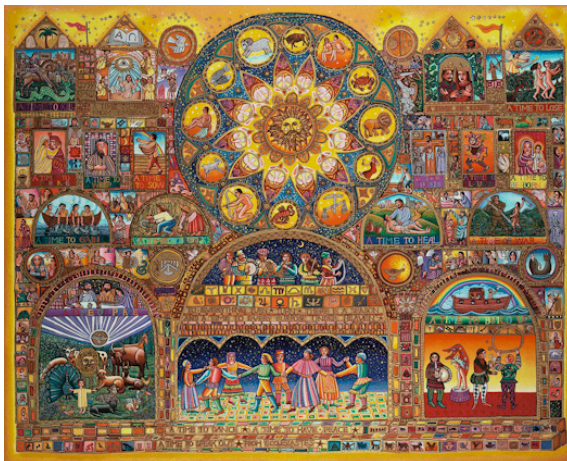
Ecclesiastes

ONLINE Worship • Holy Communion • September 5, 2021