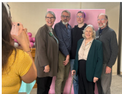
The Dodd Family having a photo taken for the scrapbook.