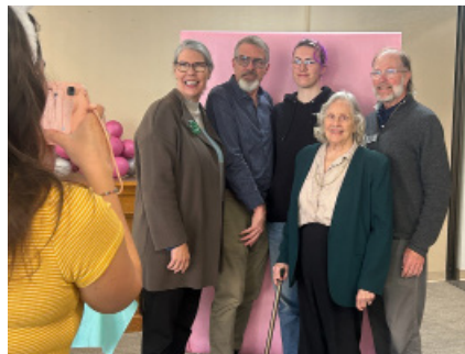
The Dodd Family having a photo taken for the scrapbook.