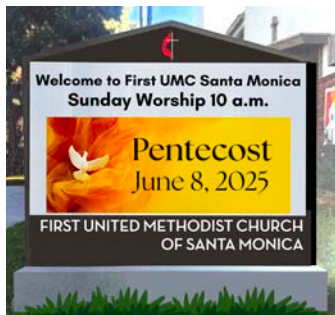
Artist rendering of signage (not exact representation)

In celebration of the 150th Anniversary, we are asking all to consider making a special milestone gift. The special donations received will be used to digitize the Sanctuary welcome monument sign, located at the corner of 11th & Washington, so we can spread our message throughout the community. Additional amounts will be used for fellowship and events during the Fall. Donations accepted anytime, online or a part of Sunday's offering. Thank you!