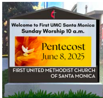
Artist rendering of signage (not exact representation)

In celebration of the 150th Anniversary, we are asking all to consider making a special milestone gift. The special donations received will be used to digitize the Sanctuary welcome monument sign, located at the corner of 11th & Washington, so we can spread our message throughout the community. Additional amounts will be used for fellowship and events during the Fall. Donations accepted anytime, online or a part of Sunday's offering. Thank you!