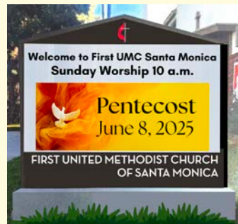
Artist rendering of signage (not exact representation)

Thank you all who have donated to the Special 150th Fund. We have received 13 donations to date so far totaling $6,300. We are $19,000 from our goal. There is still time to become part of history!!