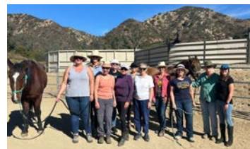
Scene from last year's Women's Retreat at Brave Grace Ranch

Registration fee directly paid to church through credit or debit: $115.