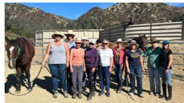
Scene from last year's Women's Retreat at Brave Grace Ranch

Retreat Dates: November 7-9, Brave Grace Ranch