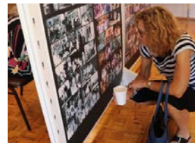
Exhibit open at 9 a.m. thru coffee hour each Sunday

FIRST UNITED METHODIST CHURCH of SANTAMONICA 1008 Eleventh Street, Santa Monica, CA 90403 • 310-393-8258