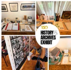
Exhibit open at 9 a.m. thru coffee hour each Sunday

As part of our 150th Anniversary celebration, the First UMC Archives Committee has opened the treasure chests of our past! From carefully preserved photographs to cherished memorabilia, we've gathered pieces that tell the rich story of our church's 150 years at the heart of Santa Monica. Come wander through the memories, discover familiar faces, and celebrate the legacy that has shaped our community.