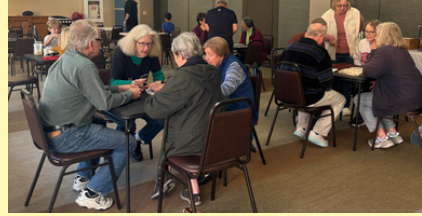
United Women in Faith Game Day