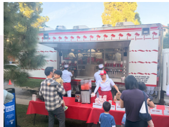
In and Out food truck at the Preschool, in celebration of 100% parent participation during the annual fundraising campaign!