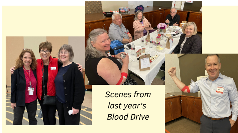
Scenes from last year's Blood Drive

Sunday, March 1, 8 a.m. – 2 p.m., Simkins Hall