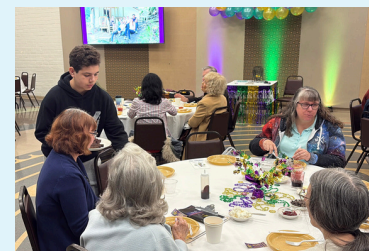
Scenes from the Pancake Breakfast Fundraiser