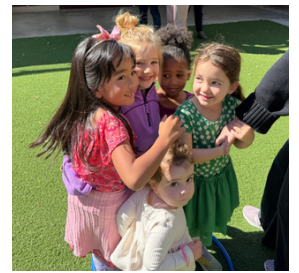
February's Messy Church