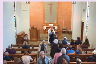
Ash Wednesday services were held at noon and 7 p.m. on February 18

Preschool is enrolling now for next School year, ages 2-5.