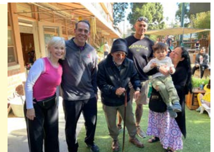
Recent Preschool events: the Lion Dance, celebrating Lunar New Year; Grandparents and Special Friends Day