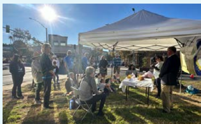
Communion at the First UMC tent in 2024

Free parking available in parking lot. Arrive early for best parking.